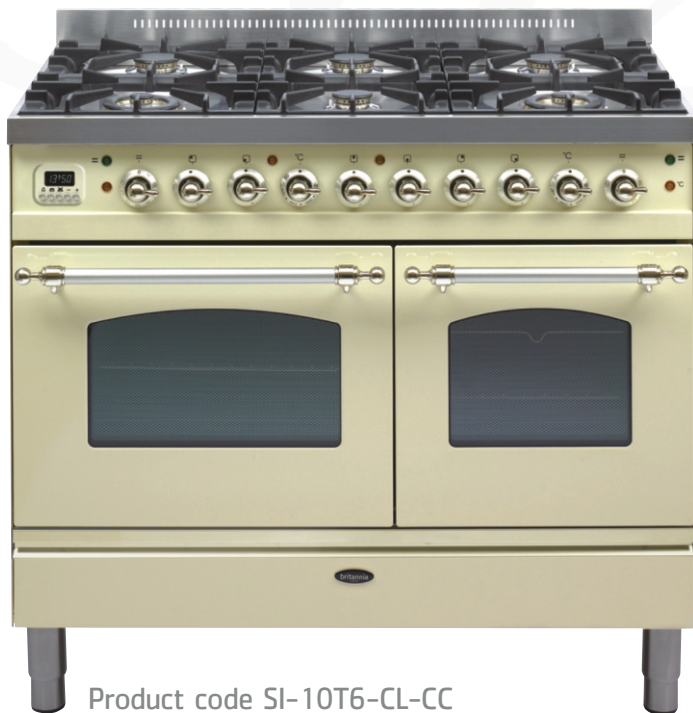
Product code SI-10T6-CL-CC

For further details please contact 0800 073 1003 www.britannialive.co.uk